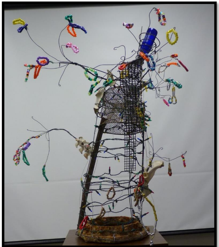
Artwork created during the Trash Transformed Workshop is currently on display in the UGRA Board Room.